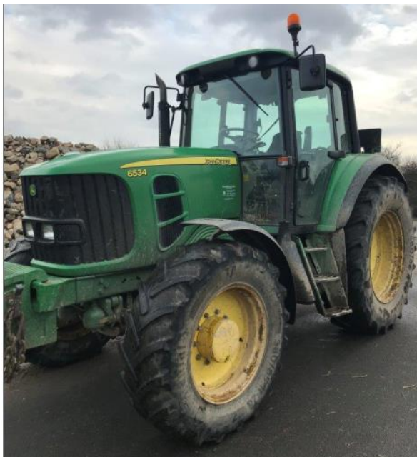
Tire Condition after 4935 Tire Hours