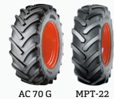
AC 70 G