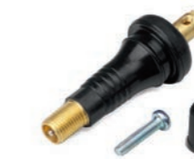
VS-69V005 TPMS valve Snap-in