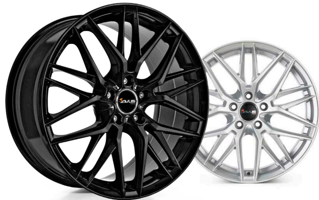
BLACK / HYPER SILVER

There is no commercial relationship with Audi