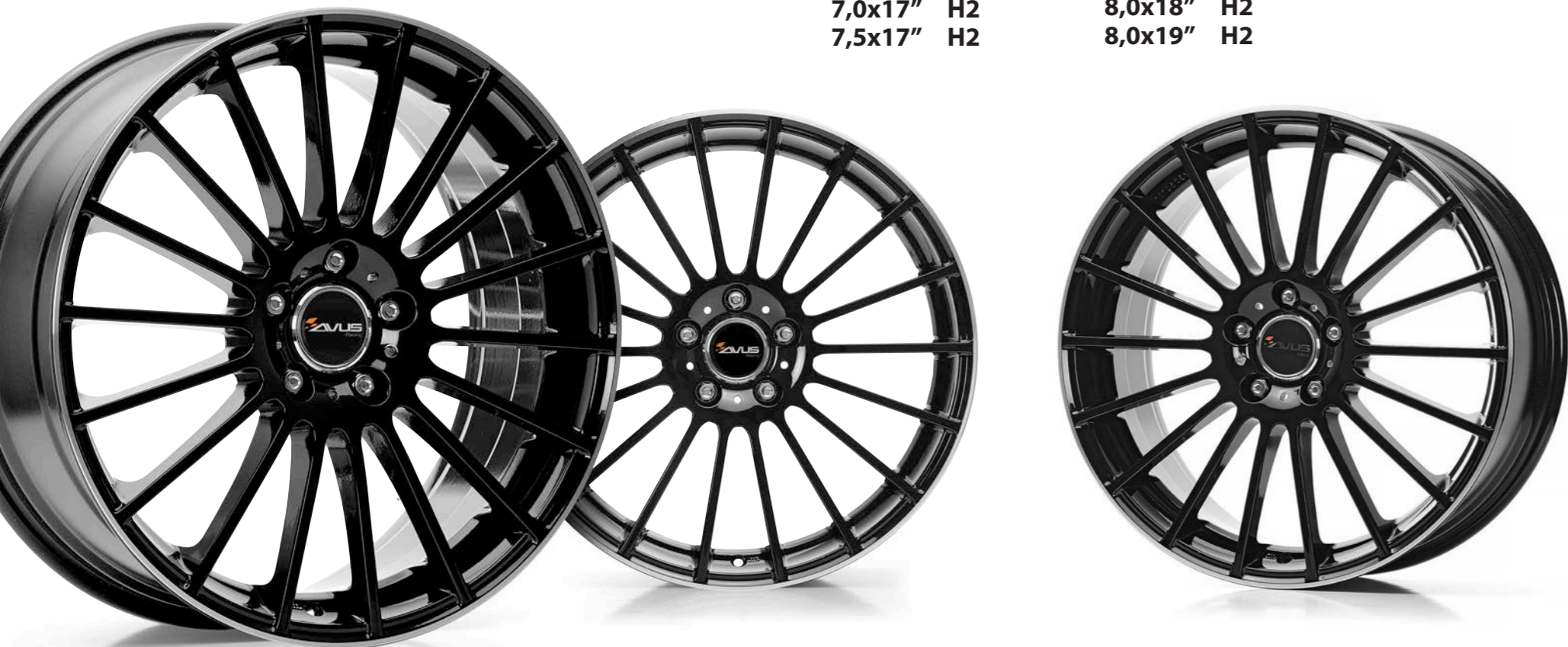
BLACK POLISHED LIP

There is no commercial relationship with Mercedes