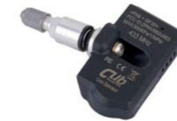
VS-62U009G UNI-Sensor Clamp-in wireless SILVER