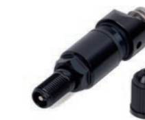
VS-69V001 TPMS valve Clamp-in black