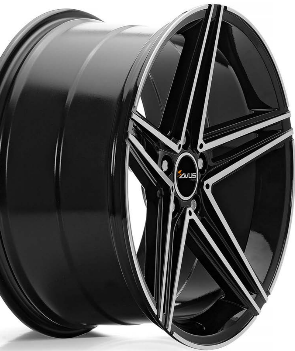
BLACK POLISHED CONCAVE VERSION

Predisposta anche per cap OE Mercedes Richiedere info