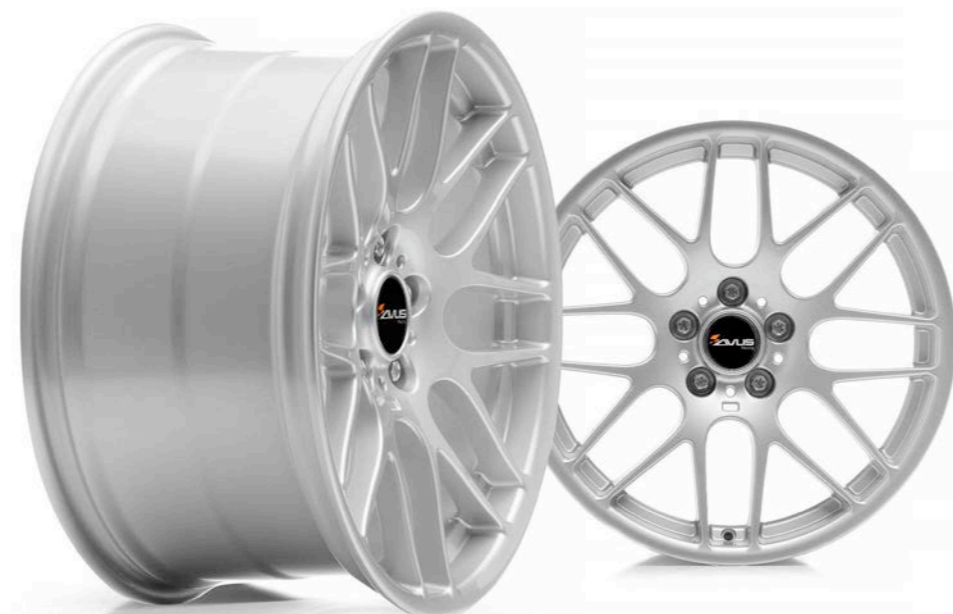
HYPER SILVER CONCAVE VERSION