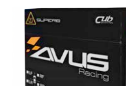
VS-60U015 Sensor AID Tool EU/US