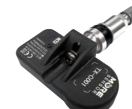
TX-C001 UNI-Sensor Clamp-in wireless SILVER