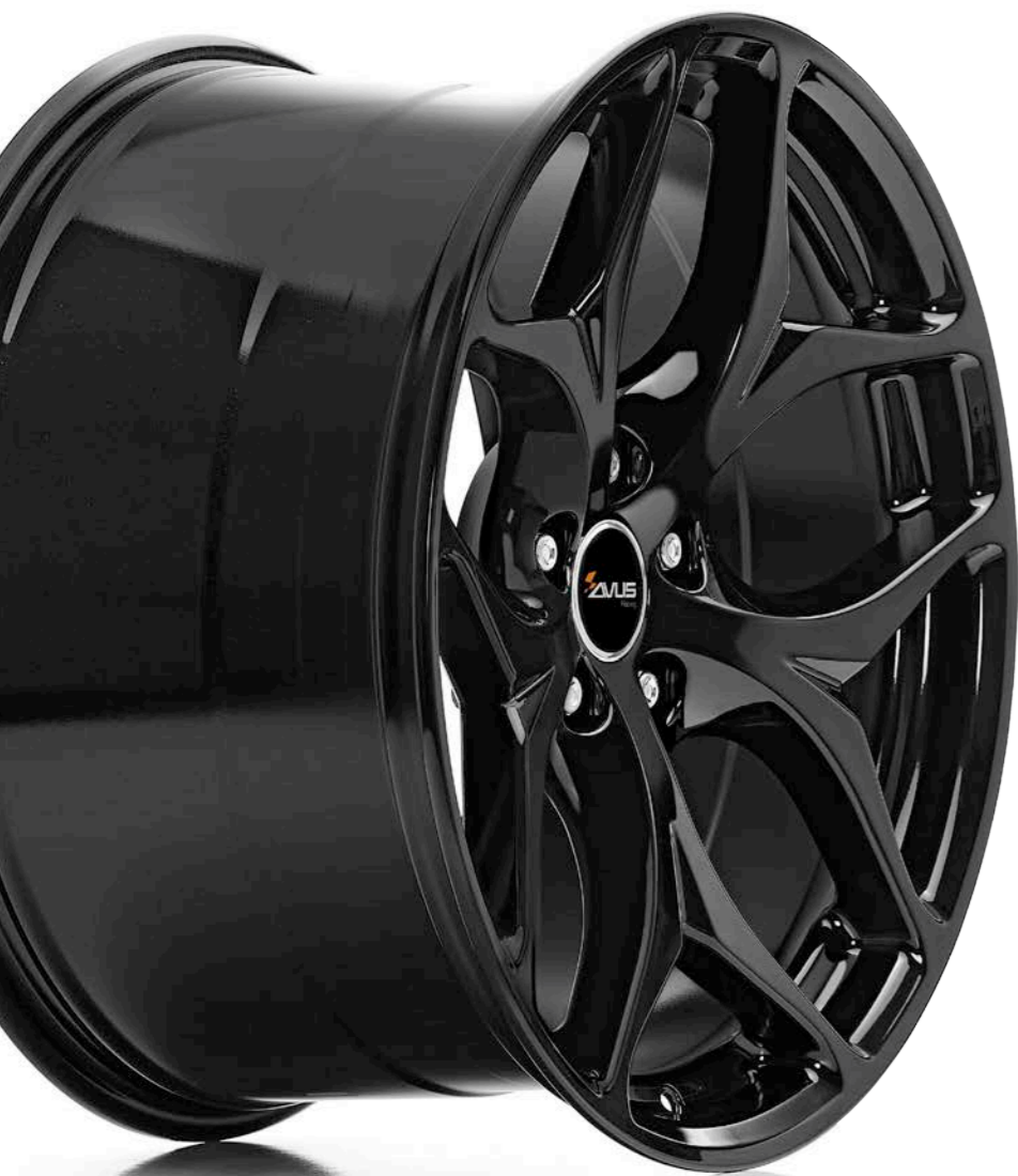
BLACK CONCAVE VERSION

Predisposta anche per cap OE Bmw Richiedere info