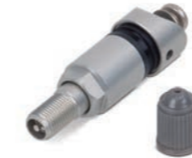
VS-69V003 TPMS valve Clamp-in silver