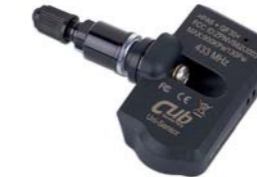
VS-62U009B UNI-Sensor Clamp-in wireless BLACK