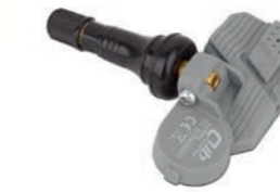
VS-62U014 UNI-Sensor Snap-in wireless