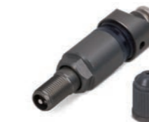
VS-69V001 TPMS valve Clamp-in grey