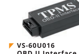
VS-60U016 OBD II Interface