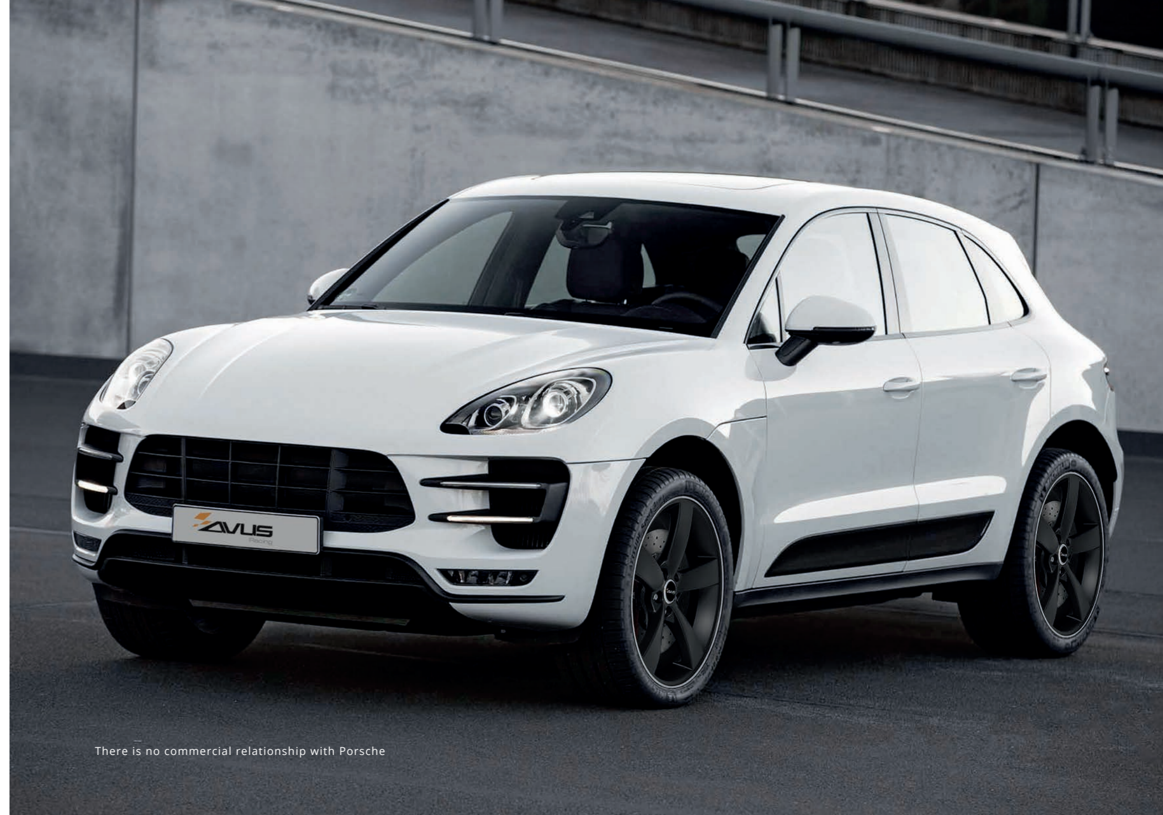
MATT ANTHRACITE POLISHED

There is no commercial relationship with Porsche