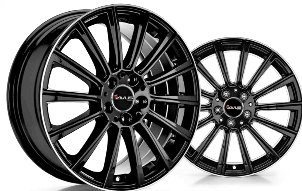
BLACK POLISHED LIP

There is no commercial relationship with Mercedes