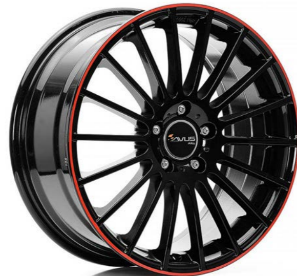
RED LINE SERIES PRODUCTION UPON REQUEST PRODUZIONE SU RICHIESTA

There is no commercial relationship with Fiat