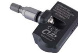
VS-62U009S UNI-Sensor Clamp-in wireless GRAY