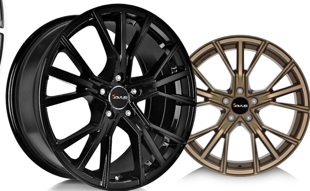
MATT ANTHRACITE POLISHED