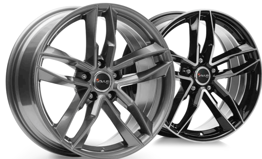
MATT ANTHRACITE POLISHED