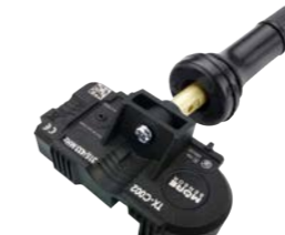
TX-C002 UNI-Sensor Snap-in wireless